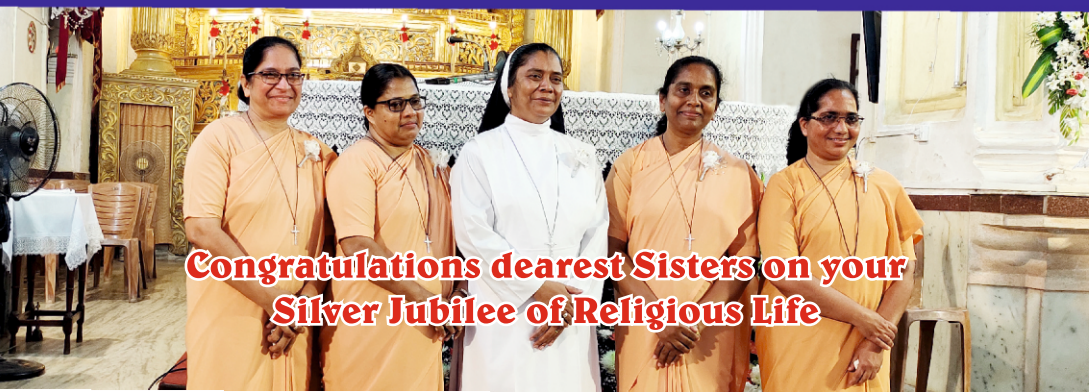
Congratulations dearest Sisters on your Silver Jubilee of Religious Life