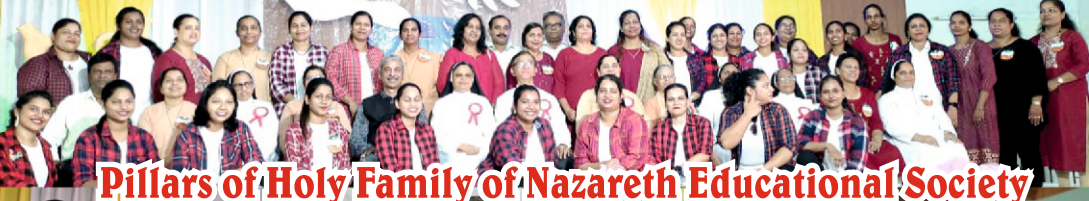
Pillars of Holy Family of Nazareth Educational Society